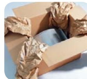
Protect fragile items with cushioning.

PAPERplus® GE produces a superior paper mattress that fills a wide range of needs!