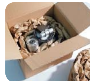
Coil or wrap to stabilise and protect heavy objects.