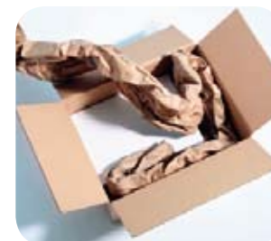
Block and brace objects to prevent migration.