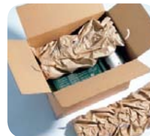
Convenient and light-weight for void-fill applications.